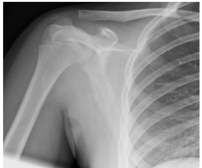
Figure 1: AP radiograph of the shoulder demonstrating irregularity of the lateral border of the scapula.

Blood tests showed a positive antinuclear antibody (ANA) with speckled pattern and a moderately raised anti-streptolysin oxygen-labile (ASO) titre, suggestive of infection; however initial blood cultures failed to identify a pathogen.