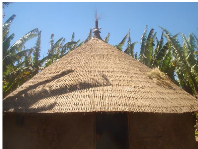
Figure 3. Traditional house constructed from bamboo and other material in Essera district.

house construction, in the beginning, the wall is of mud, reinforced with the wooden poles and bamboo culms. The underlying layer of the roof the prospective ceiling is constructed by interweaving bamboo splits against the already fixed solid culms. The bamboo sheaths are stretched horizontally over this layer and tied by interweaving bamboo that makes the roof (outer layer) of the house. The layer of the sheath, mantled in the middle of the two layers, provides waterproofing by blocking leakage through the roof. The floors inside the house are also built by splitting the culms and interweaving them against each other at ground level. The types of houses traditionally constructed of bamboo, are called "phejja"/sak'ala (Figure 3).