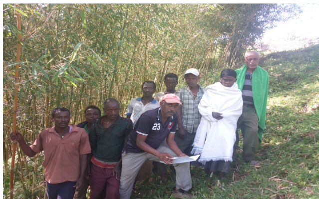
Figure 2. Focus group discussion.

The annual income generated from the sale of bamboo ranged from 260 Birr for the small income gainer to 5250 for huge income gainers from bamboo per annum. As key informant interviews and focused group discussion indicated, different bamboo products are sold and bought. For instance, local crop storing material called "yesiya" in the local language, local crop sieving material called "gilla" in the local language, local beehive, bamboo sit/desk, bamboo for house construction and bamboo shell for roof cover, bamboo for fencing, etc (Figure 2).