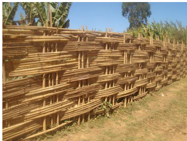
Figure 4. The type of fence constructed from bamboo.

Bamboo is also used for constructing fences of various appearances that result from different orientations of splits while interweaving. The common procedures in fencing building are the erection of short cut bamboo culms on the ground following the fencing line, followed by a closely interlocking bamboo split against the erected beams until no holes are left (Figure 4).