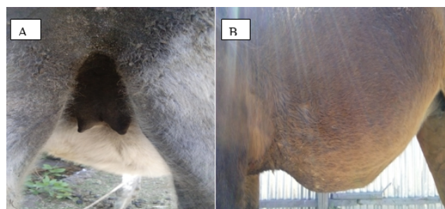
Figure 2: Edema (A) Edema of the mammary gland (Non lactating mare) (B) Ventral edema (Mare).

Edema of the mammary gland and ventral abdomen: Few of infected mares showed non-painful edema of the mammary glands and yellowish serum-like mammary secretion. Similarly, few mares showed ventral edema that extends from the sternum region to the umbilical area. In this study cutaneous wheals and plaques that are considered as important sign of cutaneous form of the disease were not observed in any of the positive mares (Figure 2).