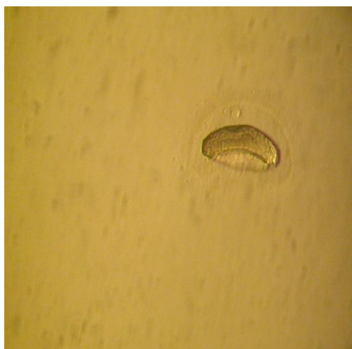
Figure 1: Rat oocyte showing full shrinkage in vitrification solution 2.