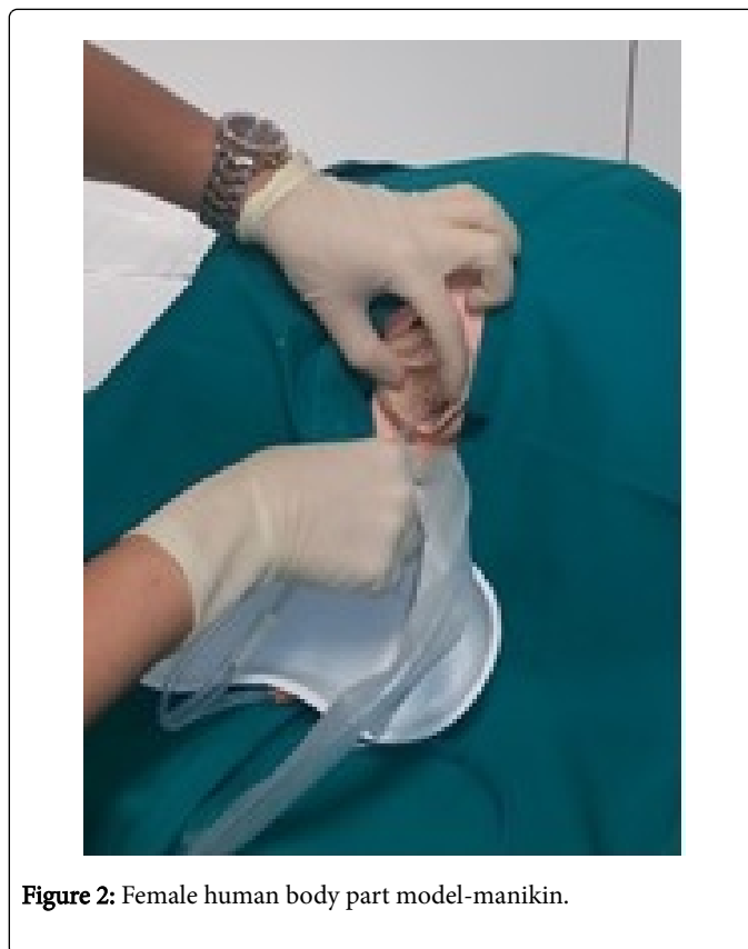
Figure 2: Female human body part model-manikin.