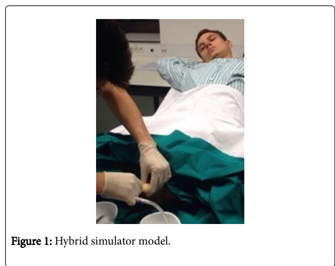
Figure 1: Hybrid simulator model.