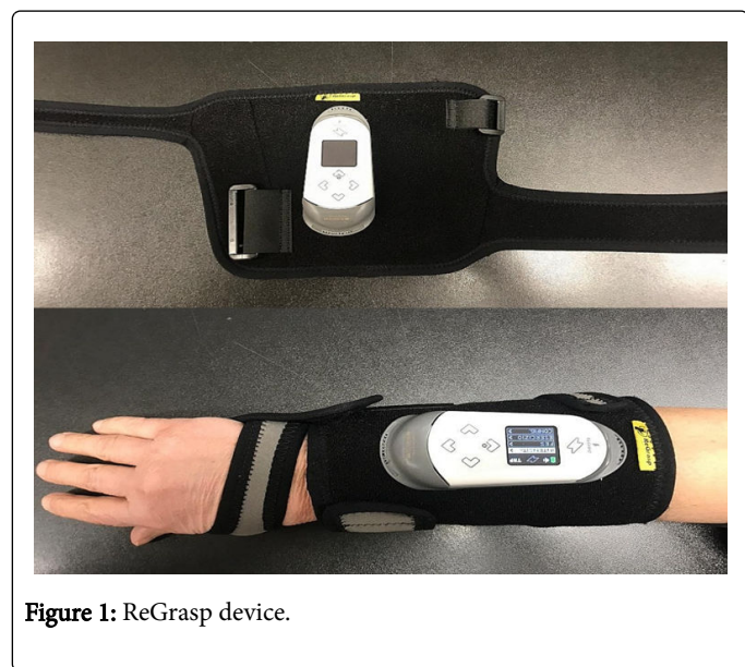
Figure 1: ReGrasp device.