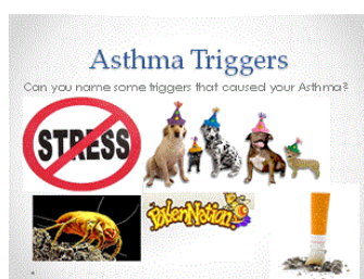
Figure 2: Asthma triggers.

According to Ritz et al. [11] study, asthma triggers linked with adverse asthma attacks and psychological triggers in particular can be associated with a lack of asthma control. For many patients their symptoms of asthma can be triggered by psychological factors like stress. The nurse needs to be aware that patients being exposed to triggers can cause the patient to recall previous memory of the trigger and its affect. Therefore controlling psychological factors reduces the severity of their symptoms and improves the management of the disease. Yorke et al. [12] was unable to draw a conclusion on the benefits of psychological intervention in the treatment of asthma, but it was thought that some psychological intervention help however further evidence based research is required. Extreme emotional expressions like stress and anxiety may cause asthma exacerbation leading to hyperventilation and hypocapnia which can cause a narrowing of the airways resulting in an asthmatic attack [13]. The Mayo Clinic [14] believes that it’s unclear if relaxation therapy techniques like yoga and hypnosis can assist asthma suffers but they do seem to reduce their stress levels which is proven to be one of the triggers for asthma. Patients need to be made more aware of their symptoms and the triggers that cause their asthma attacks in order to be better deal with their condition (Figure 2).