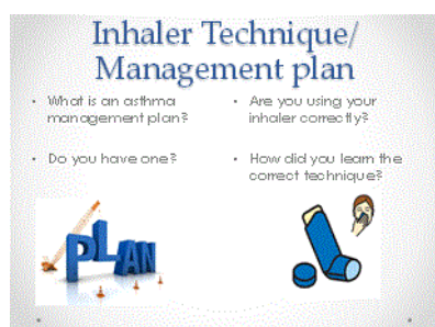
Figure 3: Inhaler techniques/management plan.

GINA guidelines [1] supports that all asthma patients should have access to skilled training of inhaler use along with information on asthma and personal self-management guidelines on symptoms, peak flow and asthma management plan. Good inhaler techniques are essential to ensure effective therapies. Also, patient techniques need to be reviewed at regular intervals. Inhalers are devices which deliver medication to the airways in the treatment of chronic respiratory diseases. When used correctly inhalers relieve and improve patients' symptoms. Asthmatic patient care can improve with consistent and frequent monitoring of patient inhaler techniques [27]. However, adherence to inhaler medication has been shown to be poor, leading to reduced clinical outcomes, medications wasted, and higher healthcare costs [28]. Poor inhaler techniques contribute to a lack of asthma control which may contribute to unnecessary treatment and hospitalization [29] (Figure 3).