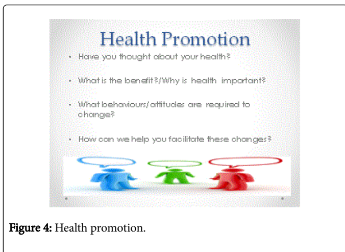
Figure 4: Health promotion.

Health promotion is a process of enabling people to increase control over their lives whereas health education is information given to influence people behaviours, attitudes and knowledge [3]. Health promotion and health education can be words spoken that are switchable and may cause confusion at times [36]. Health Promotion is a movement that endorses health and is linked by values; example would be the Ottawa Charter, empowerment and awareness. Under the Ottawa Charter there is a number of health promotion principles like building healthy public policy, creating supportive environments, developing personal skills, strengthening community action and re-orient health service [3]. It is interesting to this day that this principle remains the focus and was discussed at the 8th global conference on health promotion in Helsinki 2013 (Figure 4).