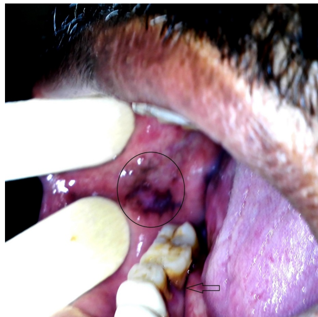
Figure 1: Oral mucosal pigmentation on the buccal mucosa of a 40 years old male. Chronic periodontitis is also evident (arrow).

dysplasia, G2 + Moderate dysplasia, G3 + severe dysplasia) [9]. No significant association ( p > 0.05 ) was seen with age, gender and the duration of ART with the frequency of oral lesions.