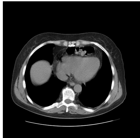
Figure 1: CT scan shows bowel in the pericardium.

was qualified for surgical intervention. A planned surgical procedure under general anesthesia was performed.