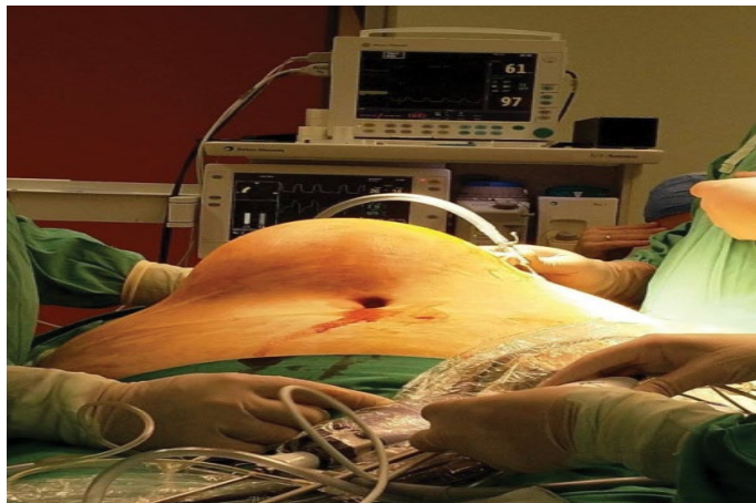
Figure 1. Big epigastric hernia before surgery.

General Surgery Department, Iaso Thessalias, Greece