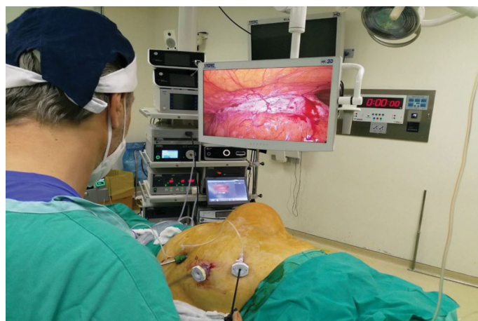
Figure 2. Robotic hernia repair. Port placement for robotic hernia repair distant from mesh placement area.