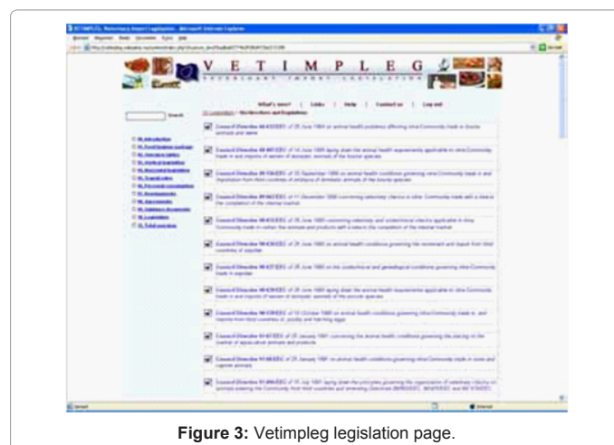
Figure 3: Vetimpleg legislation page.

Vetimpleg is a production of Zilt&co and Marcuvet. Zilt&co is a Dutch web publishing office. Marcuvet is a Dutch editorial office specializing in veterinary and food legislation