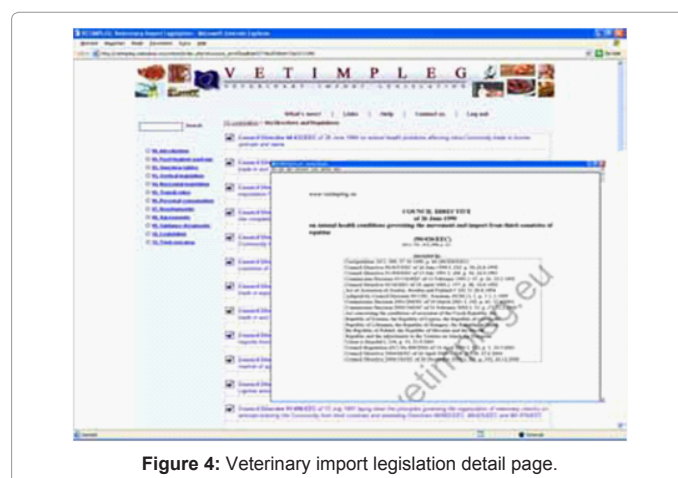
Figure 4: Veterinary import legislation detail page.