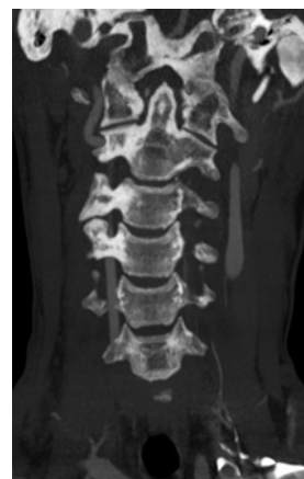
Figure 1: Angio TC imaging showing left vertebral artery with irregularity of the lumen and a possible mural thrombus.

Looking at the all examination the patient was started on anticoagulation therapy with heparin and bridged to warfarin as secondary prevention. During recovery patient complained